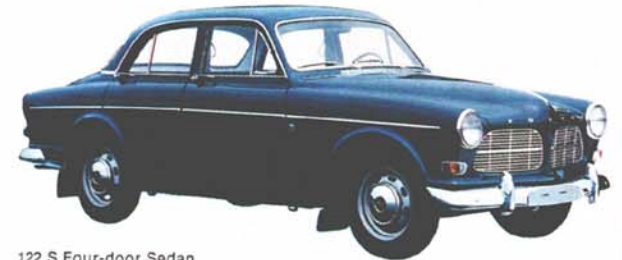
122 S Four-door Sedan