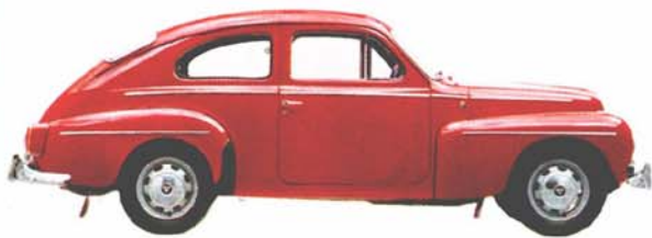
544 Two-door Sports Sedan