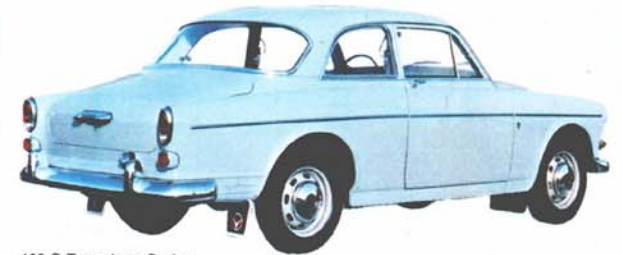
122 S Two-door Sedan