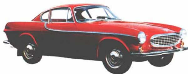
1800 S Touring coupe