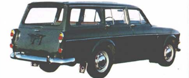
122 S Station Wagon