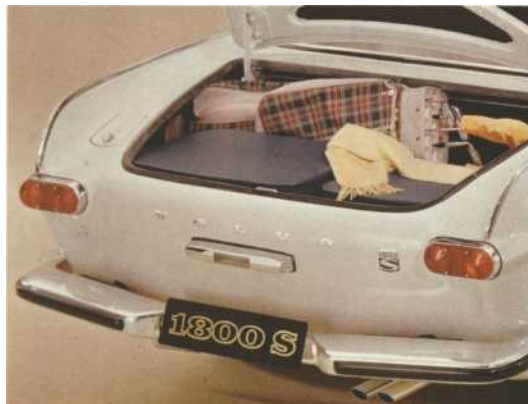
Exceptional luggage capacity.