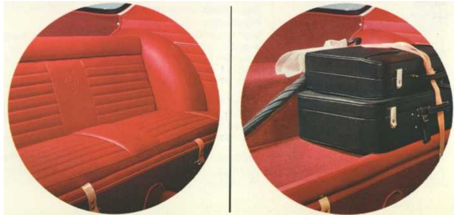
Occasional seating behind the driver. Very exceptional luggage carrying capacity with leather strap tie-downs.