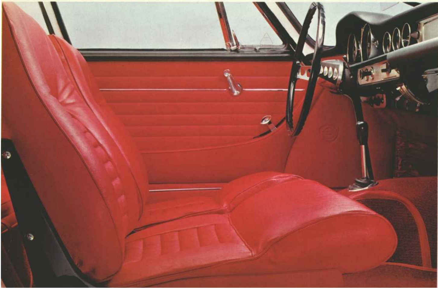
Almost infinitely adjustable seats - try them for size