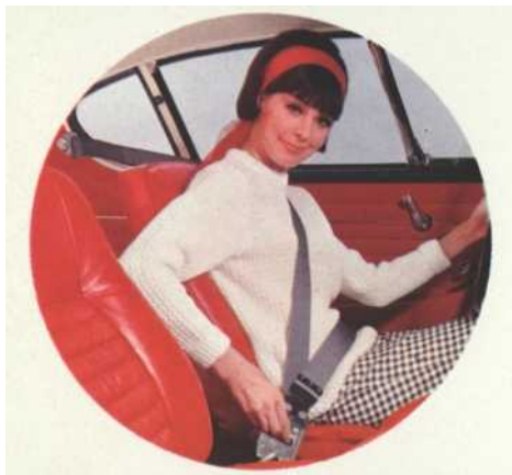
All controls are easily to reach with the seat belt firmly on.

The Volvo 1800 S is a Grand Turismo Coupe. (A Grand Turismo Automobile is a car in which one can travel long distances rapidly and in comfort).