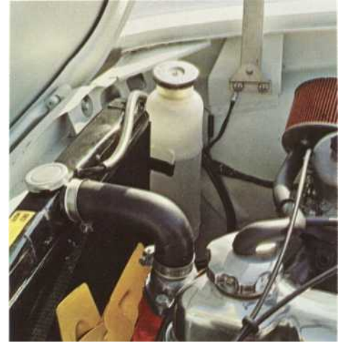
The sealed cooling system keeps the radiator from blowing its stack.