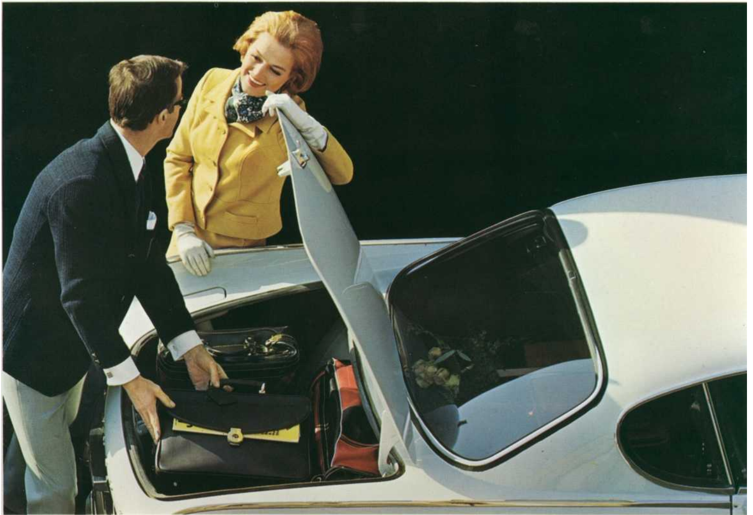
The trunk provides ample room for the amount of luggage two people carry.