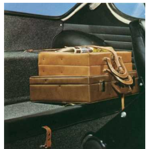
or fold down into a luggage rack.