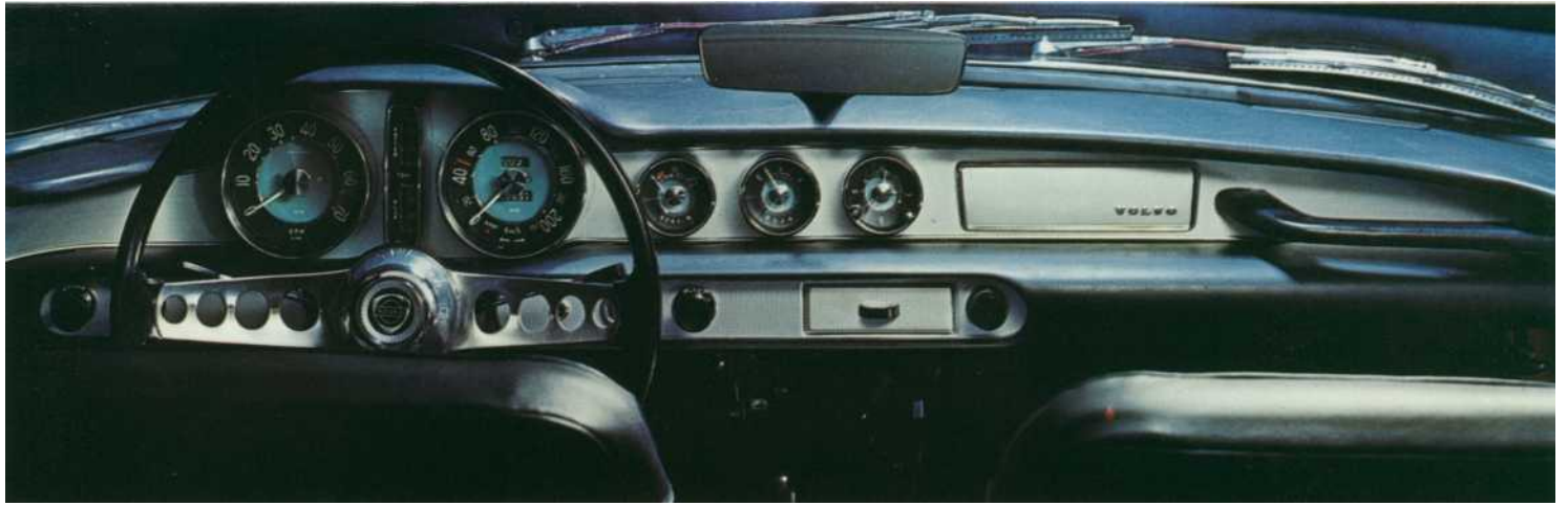
The instrument panel and padded dash are as good-looking as they are functional.