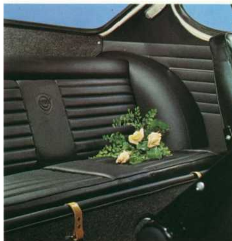
The occasional seat will carry two passengers ...