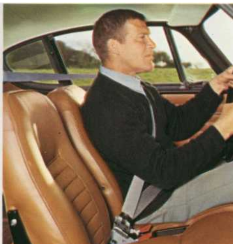
Three - point safety belts are standard equipment.