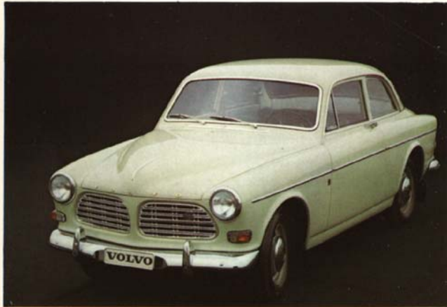
Volvo 122 S, two-door Sedan