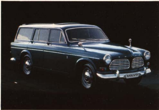
Volvo 122 S, Station Wagon