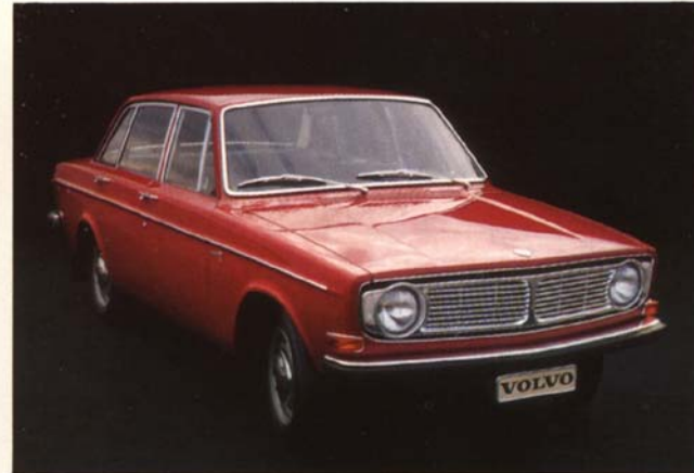
Volvo 144 S, four-door Sedan