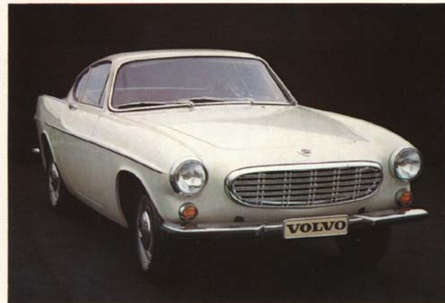
Volvo 1800 S, GT Coupe